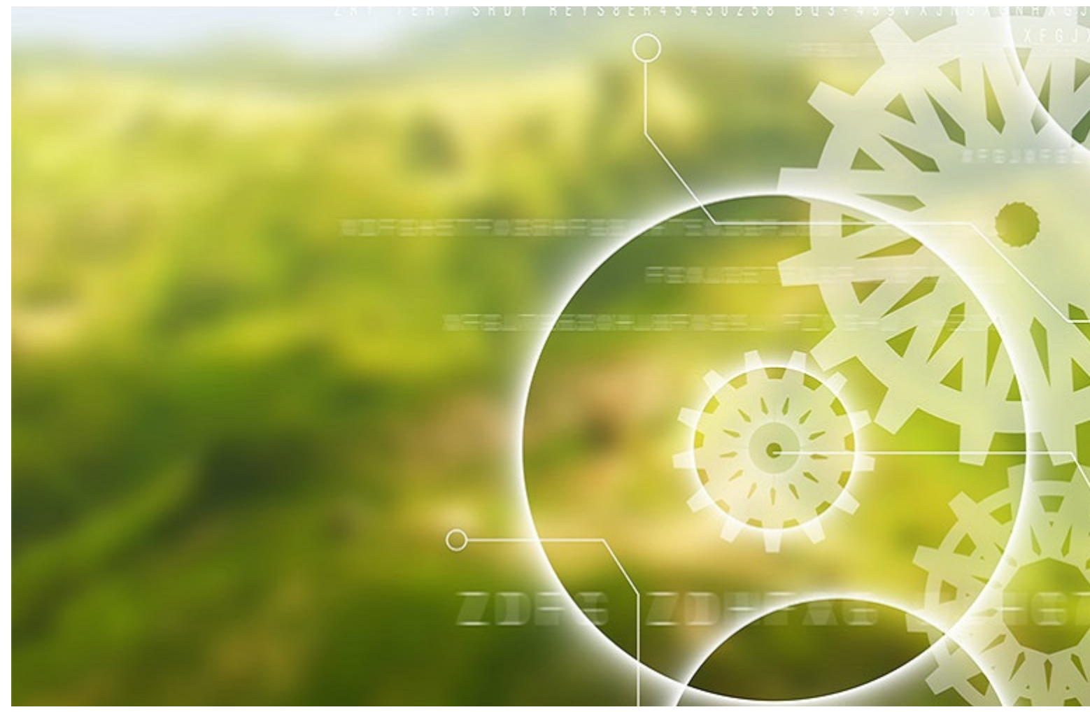
Written on 10 September 2019 1 minutes of reading News