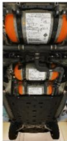
FC vehicle on the chassis dynamometer / FC vehicle tanks