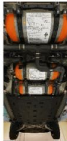
FC vehicle on the chassis dynamometer / FC vehicle tanks