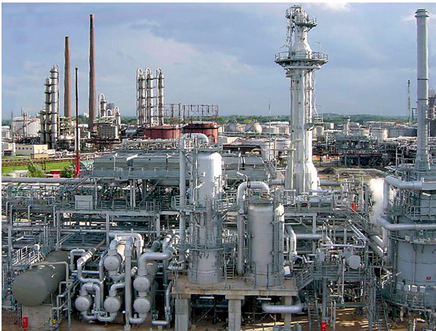
Prime G+ unit

In 2021, 300 Prime-G+® units are being operated around the world, producing ultra-low sulfur gasoline meeting the strictest environmental regulations.