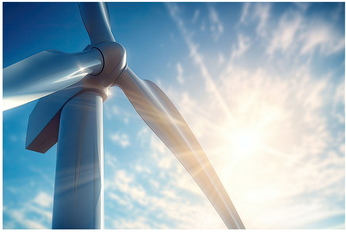
Written on 27 March 2025