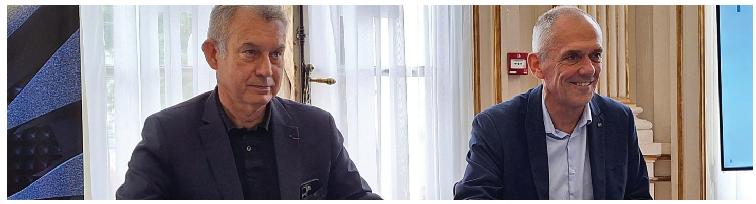
Written on 08 October 2024